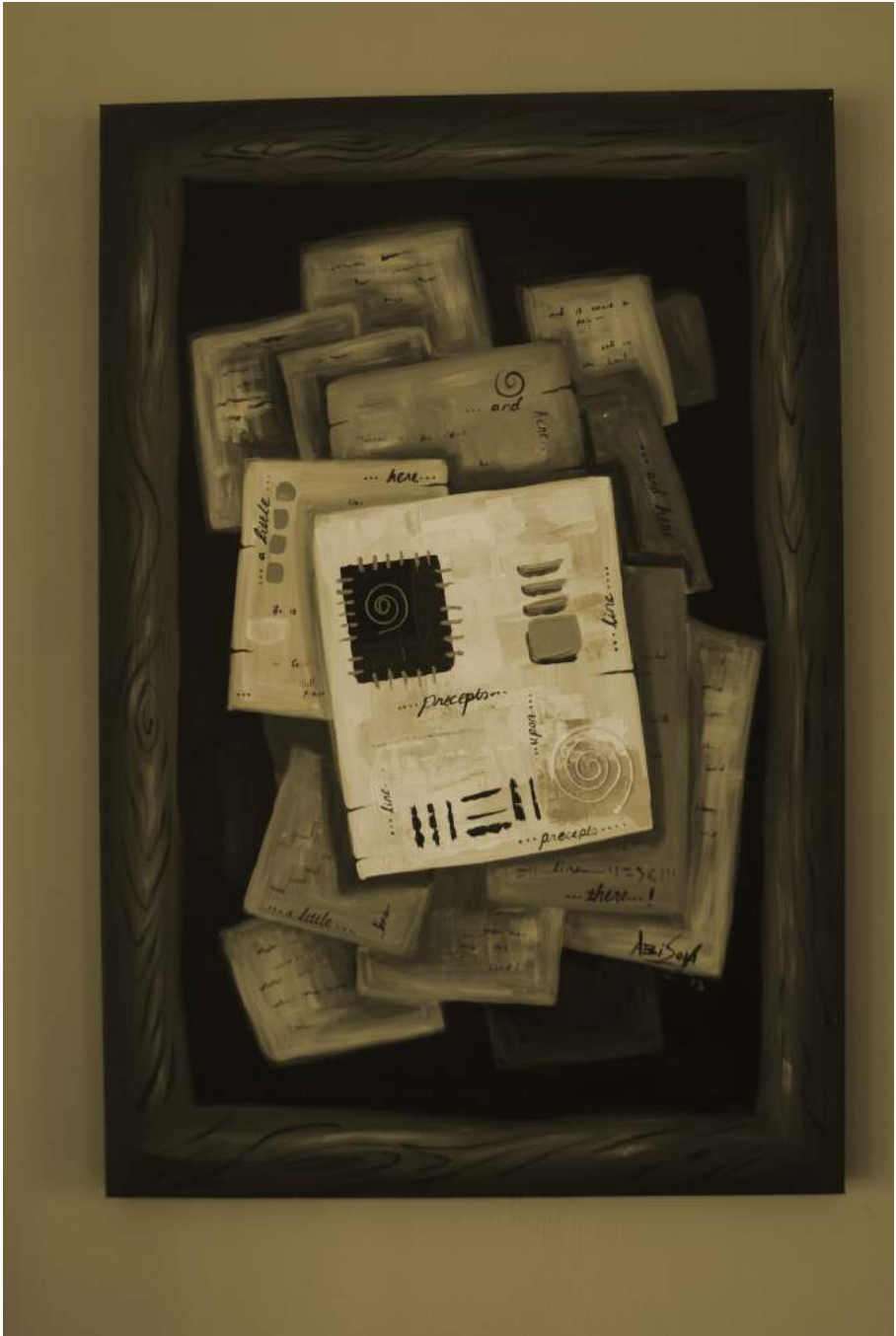
EKKLESIA: SCHOOL OF LOCAL CHURCH