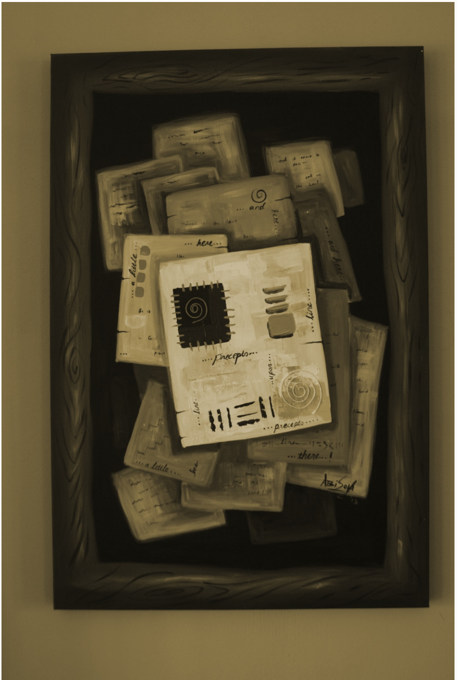
EKKLESIA: SCHOOL OF LOCAL CHURCH