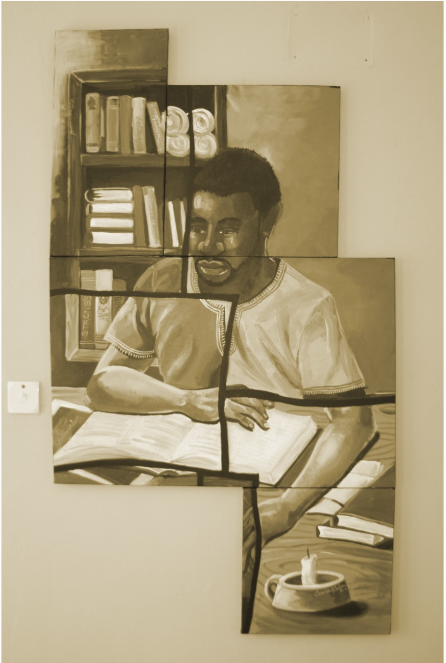
EKKLESIA: SCHOOL OF LOCAL CHURCH